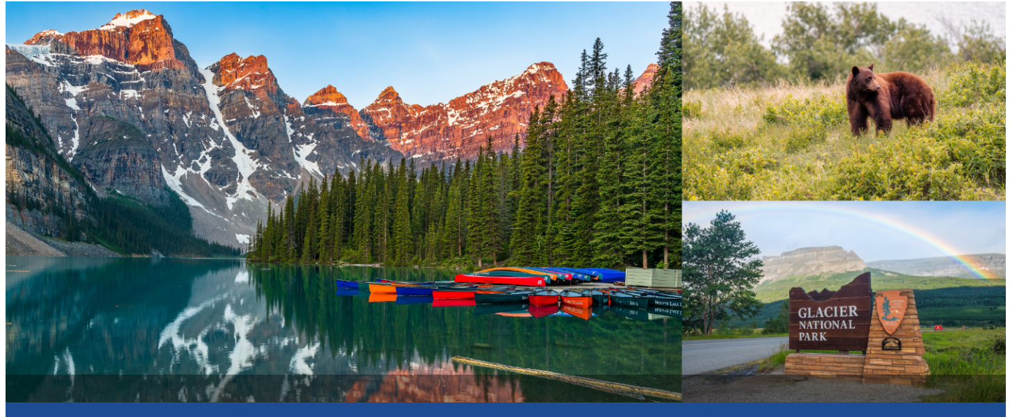
Friday · July 5th, 2024 - Thursday · July 11th, 2024