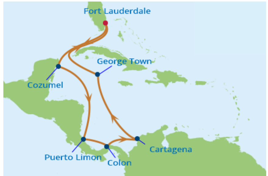
PORT OF DEPARTURE: ● PORT OF CALL: ● CRUISE ROUTE: —